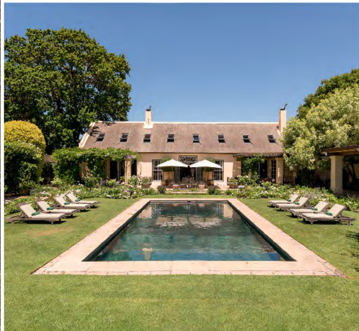
Clockwise from top left Borgo Finocchieto in Tuscany. La Rive in the Franschhoek winelands, Cape Town (also bottom right). Villa Glamour in Saint-Tropez