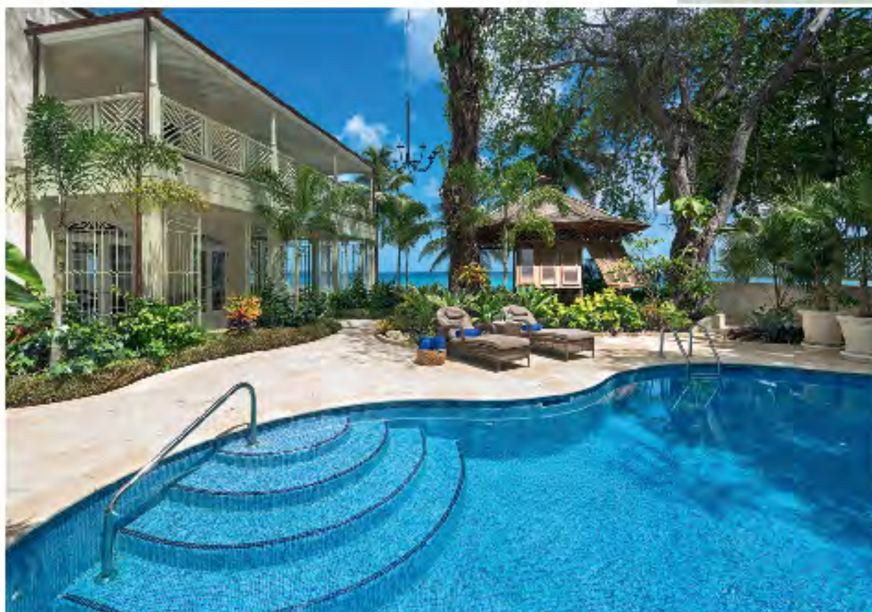
Hemingway House in Barbados, with its curved pool