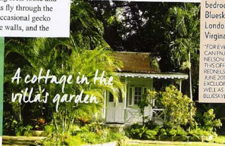
A cottage in the villa's garden