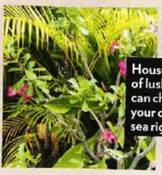
Housed in two acres of lush gardens, you can choose between your own pool or the sea right in front